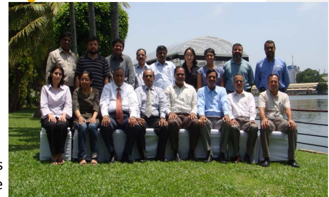
R11 Chapter Leaders Meet – April 2012

Refer http://www.pmi.org.in/pmbok-hindi/