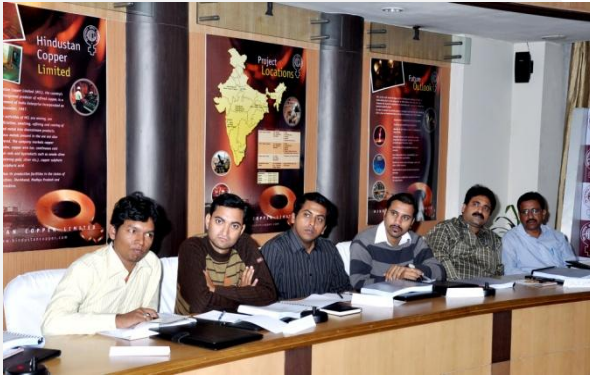
HCL PM Training session

Project Management Awareness Program for Hindustan Copper Limited - The Chapter conducted a two day Project Management Awareness Program for the project management professionals of Hindustan Copper Limited (HCL), a public sector enterprise of the Government of India. It has the distinction of being India's only vertically integrated copper producing company encompassing mining, beneficiation, smelting, refining and casting of refined copper metal.